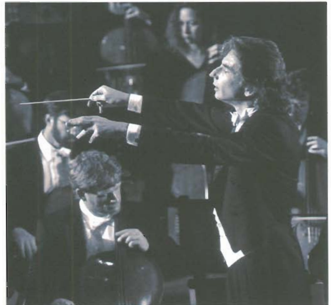
The board of the San Francisco Symphony reads like an excerpt out of the Social Register.

Aside from explicitly recognizing some board members as governors and some as nongovernors, little else would have to